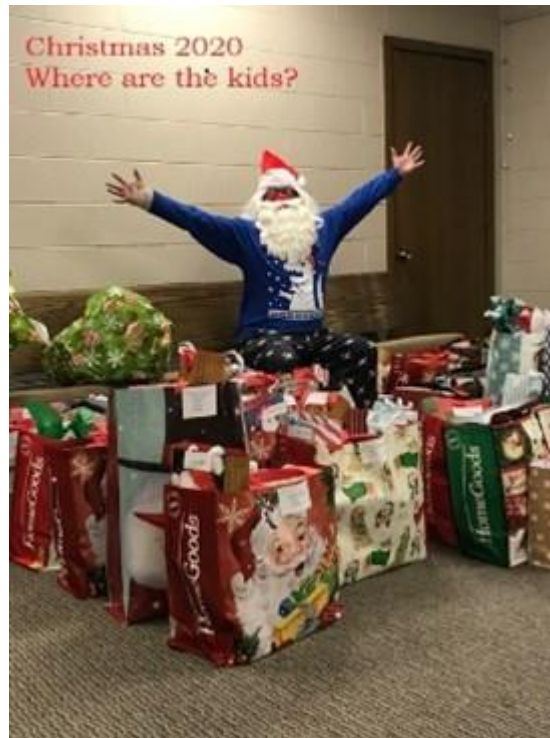
Christmas 2020 Where are the kids?