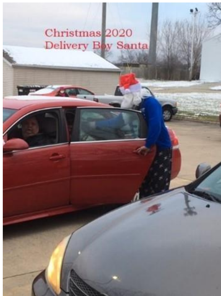
Christmas 2020 Delivery Boy Santa